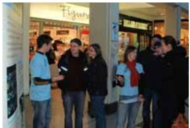
Volunteers talking to the public in Lion Yard, Cambridge.

Analysis of the forms and comments from visitors to the displays indicated that about half of those surveyed already knew of the proposal, and 95 per cent would be likely to use the facility for land and water-based leisure pursuits. The majority – over three quarters – would want to cycle, and a similar proportion would to use the site to walk or jog.